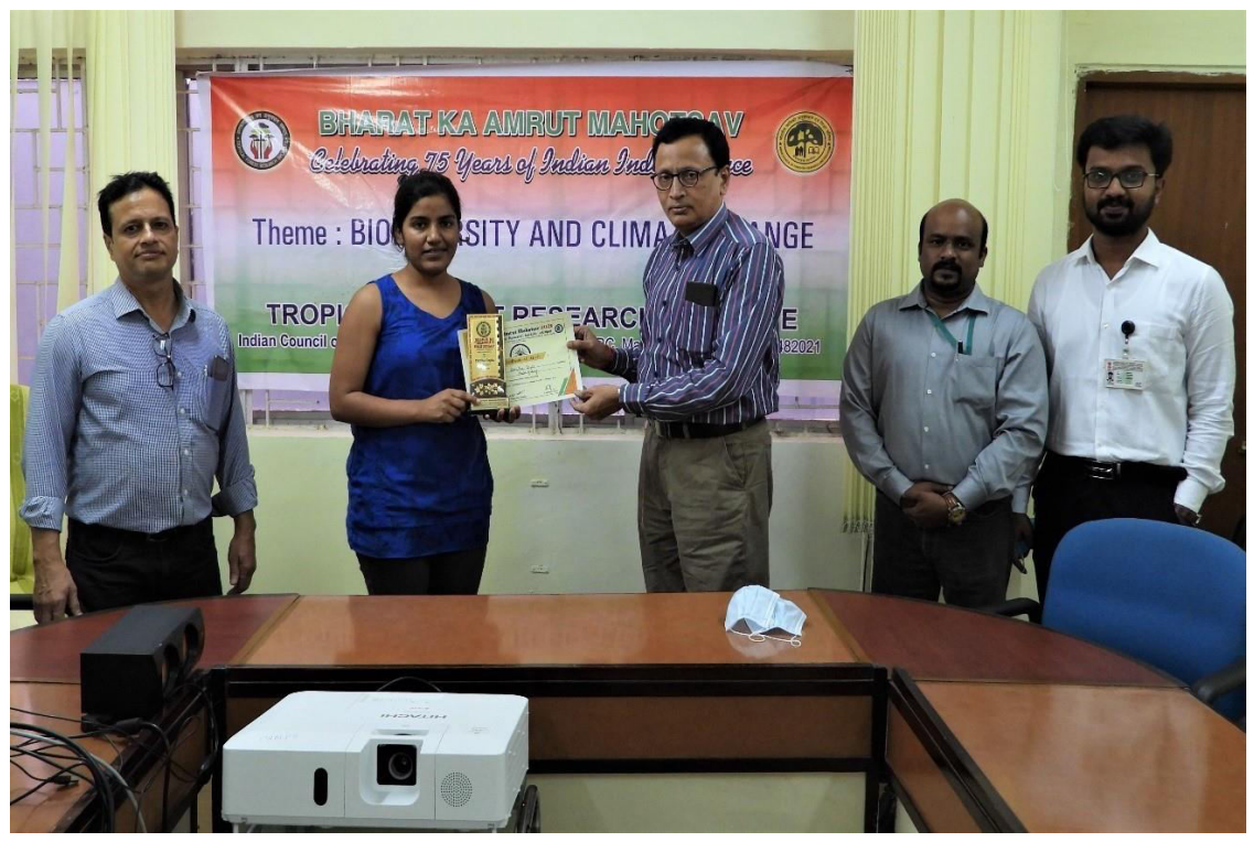
Prize distribution to the winners of competitions of Azadi ka Amrut Mahotsav atTFRI, Jabalpur