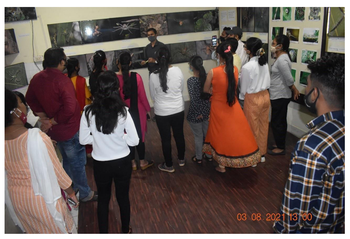
Visit of students and research scholars to the Arachnarium during an event of Azadi ka Amrut Mahotsav