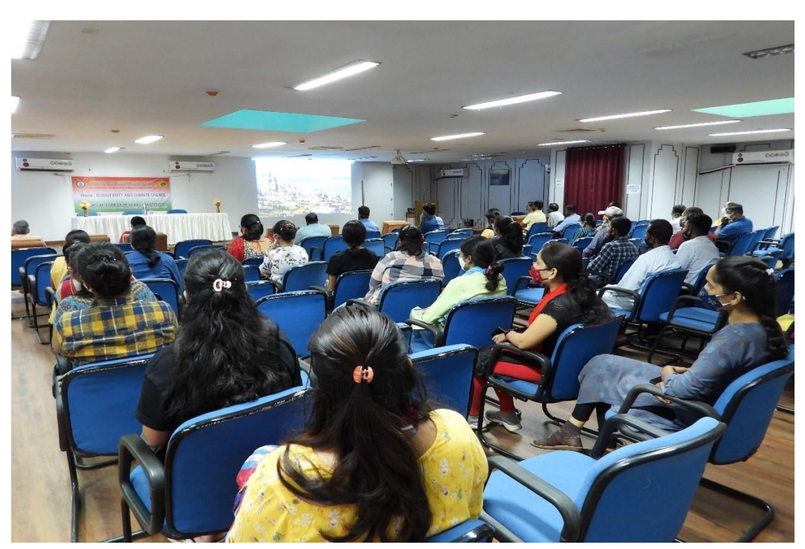
Screening of documentaries for scientists, officers and scholars during an event of Azadi ka Amrut Mahotsav