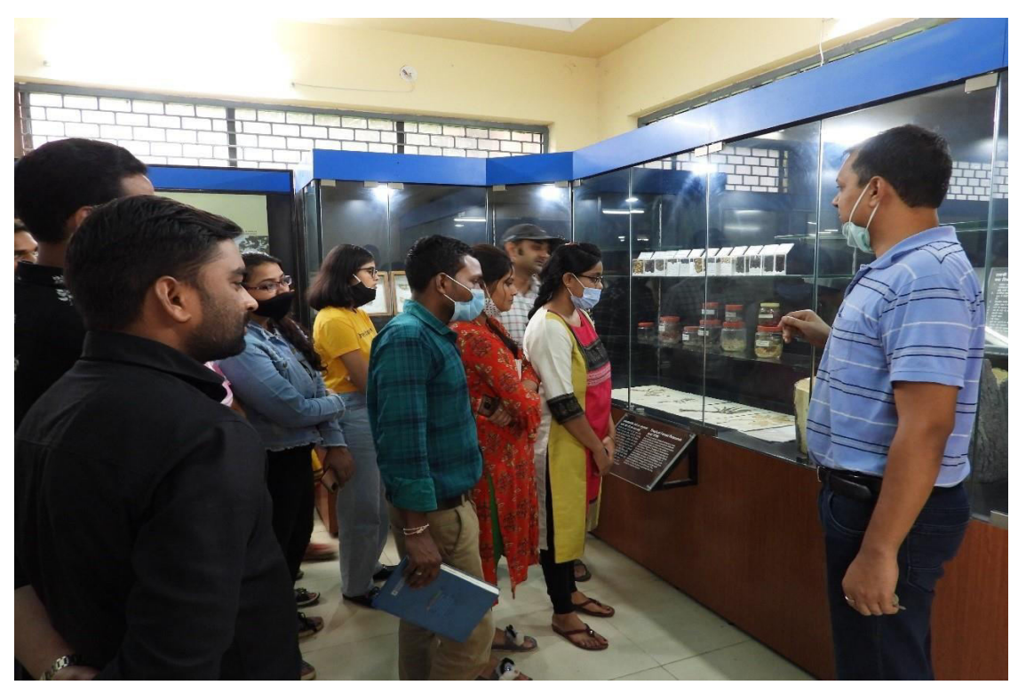
Scholars and student learning about institutional activities related to biodiversity and climate change at TFRI Museum during an event of Azadi ka Amrut Mahotsav