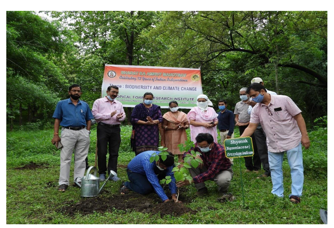
Plantation of saplings at the Botanical Garden, by Director, TFRI during the plantation event of Azadi ka Amrut Mahotsav