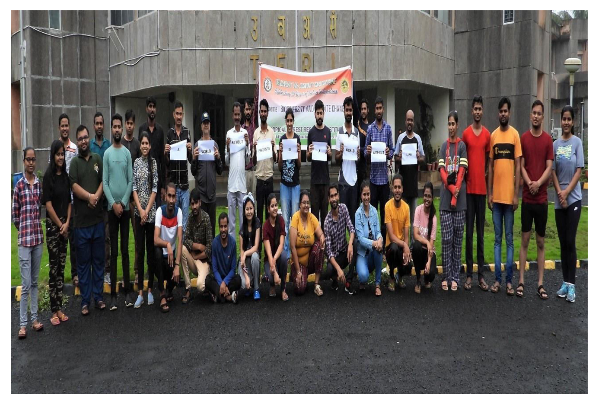
Participants of treasure hunt to know biodiversity during an event of Azadi ka Amrut Mahotsav at TFRI, Jabalpur